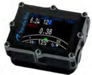
Customized Diver6 Shearwater Petrel

The Shearwater products enhance Diver6 by providing added vital information (tank pressure and dive computer data) and navigational information for assisting and sending divers to locations.