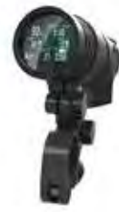
Customized Diver6 Shearwater NERD