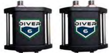
Shearwater Single / Dual Pressure Sensor